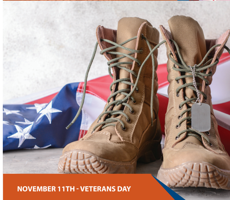
NOVEMBER 11TH - VETERANS DAY