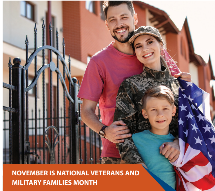
NOVEMBER IS NATIONAL VETERANS AND MILITARY FAMILIES MONTH