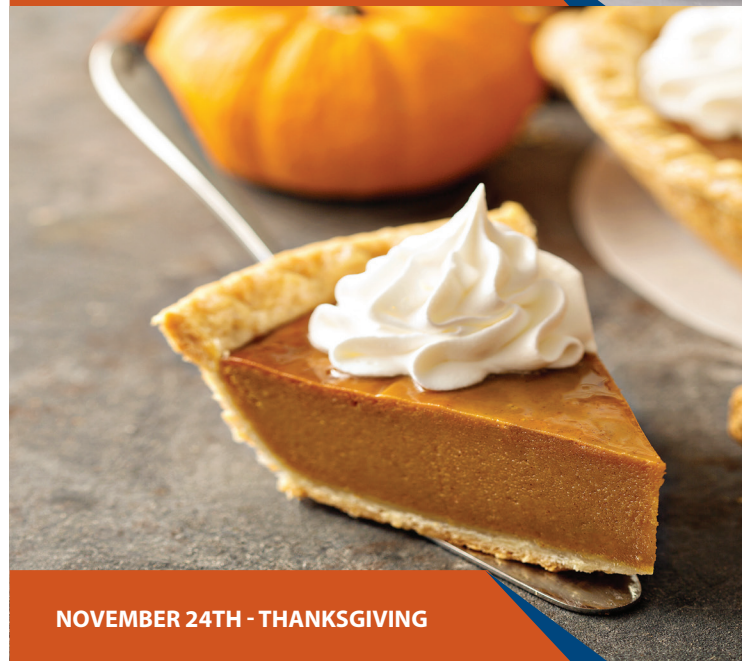
NOVEMBER 24TH - THANKSGIVING