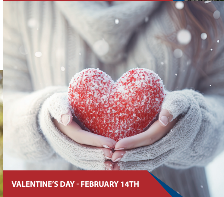
VALENTINE'S DAY - FEBRUARY 14TH