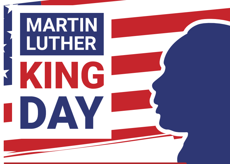
MARTIN LUTHER KING JR DAY - JANUARY 15TH