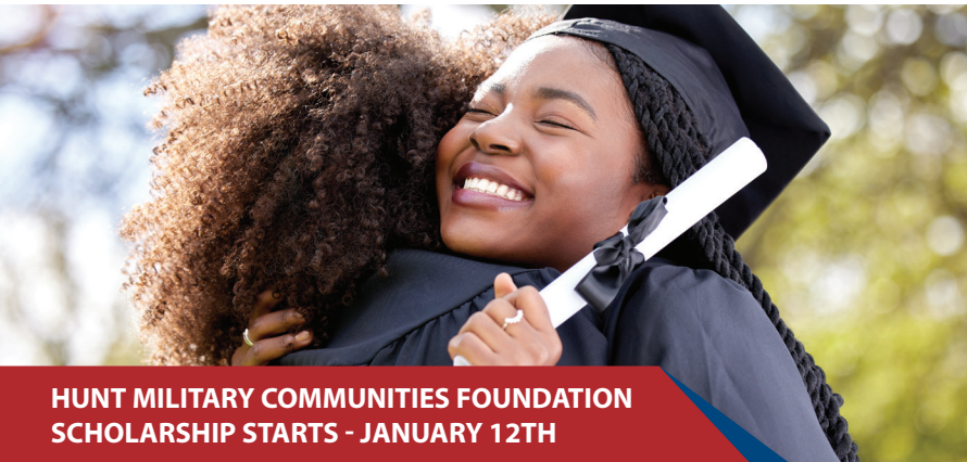
HUNT MILITARY COMMUNITIES FOUNDATION SCHOLARSHIP STARTS - JANUARY 12TH